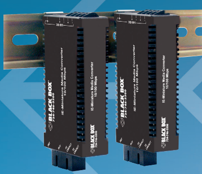
Industiral MultiPower Media Converters. installed on a DIN rail